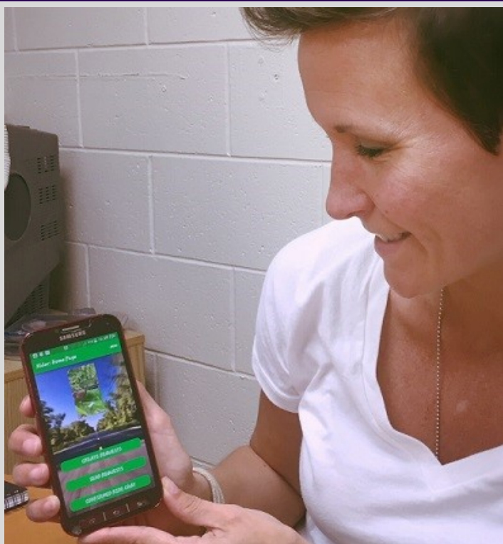
A Southwest Michigan ERN Success Coach helps an employee navigate the "Driven to Succeed" app to find a ride to work.