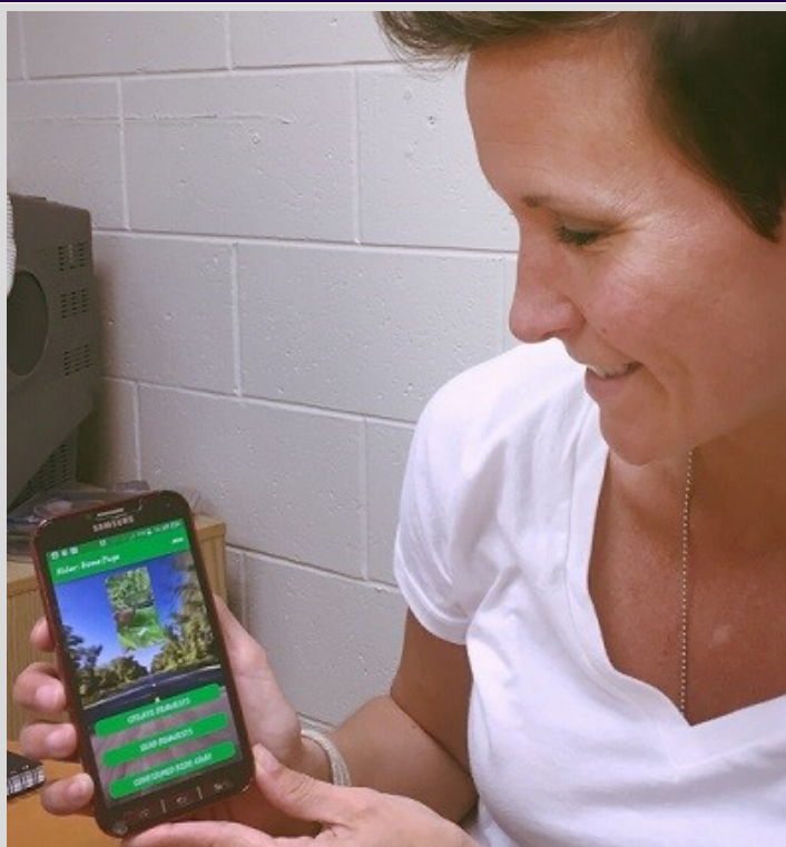
A Southwest Michigan ERN Success Coach helps an employee navigate the "Driven to Succeed" app to find a ride to work.